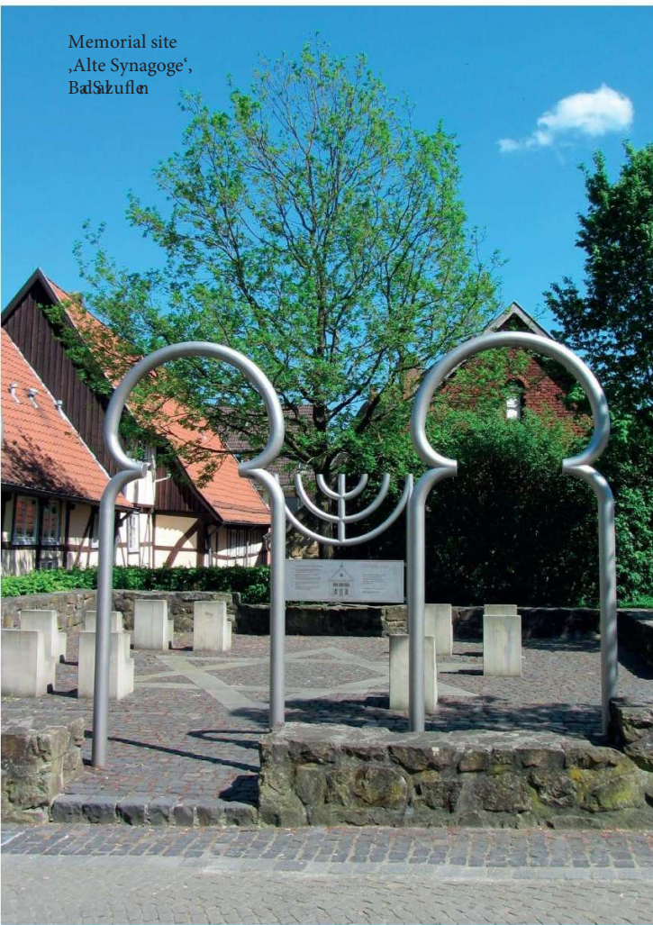
Memorial site 'Alte Synagoge', BalSzkufn

GESELLSCHAFT FÜR CHRISTLICH-JÜDISCHE ZUSAMMENARBEIT IN LIPPE E.V.