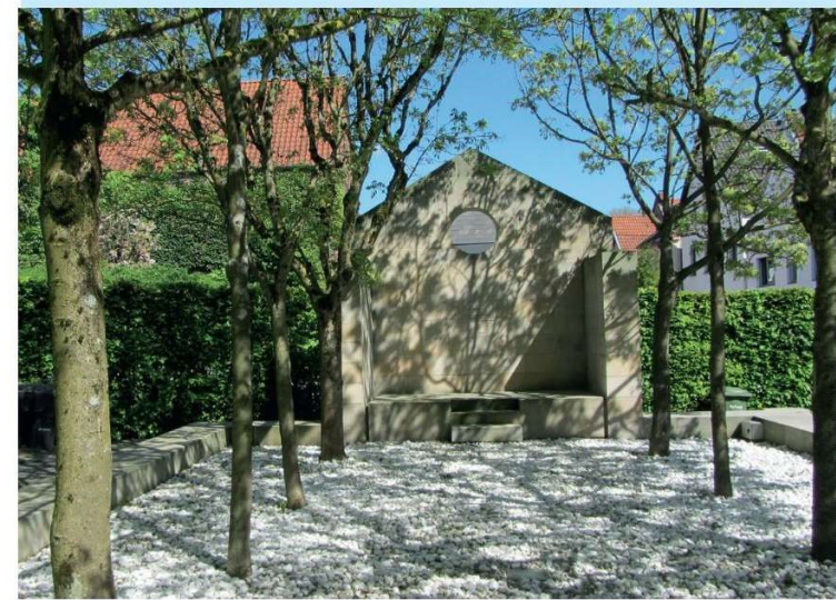
Memorial site ‚Synagoge Lemgo‘

Meanwhile 28 volumes of our own series of publications have been compiled under the heading „ PANU DERECH - Prepare the Way “; they can be studied, borrowed or bought. The series concerns itself with theological and historical questions, presents individuals or families and reminds the reader of events in the recent history of the region.